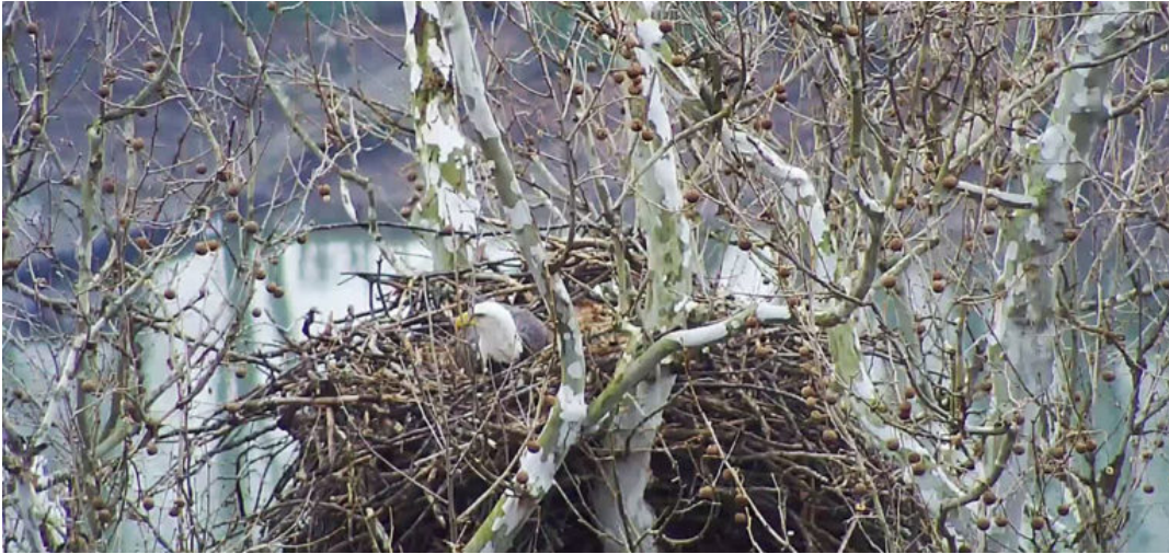
The Harmar nest